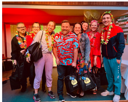
2024 FOTV Trivia Champions - KINDY CATS!

We turn our attention now to the upcoming LLv Athletics Carnival, where FOTV will be having a huge cake stall and sausage sizzle! It's also just a few weeks before we open up our annual FOTV Online Raffle! The Raffle has so many great prizes up for grabs and will be drawn at Winterfest on Wednesday 3 July.