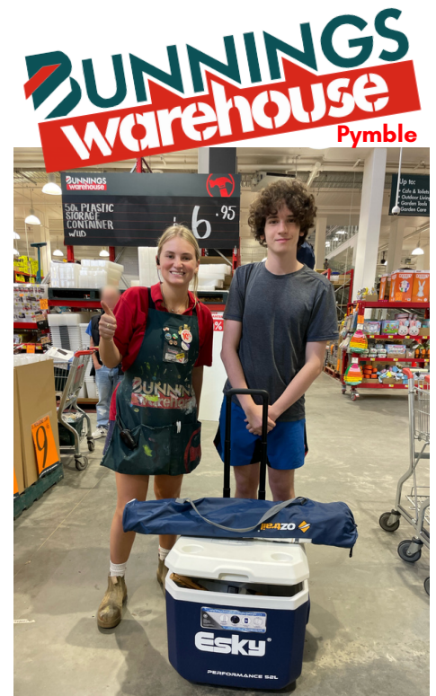
Picking up the donations from Bunnings in Pymble