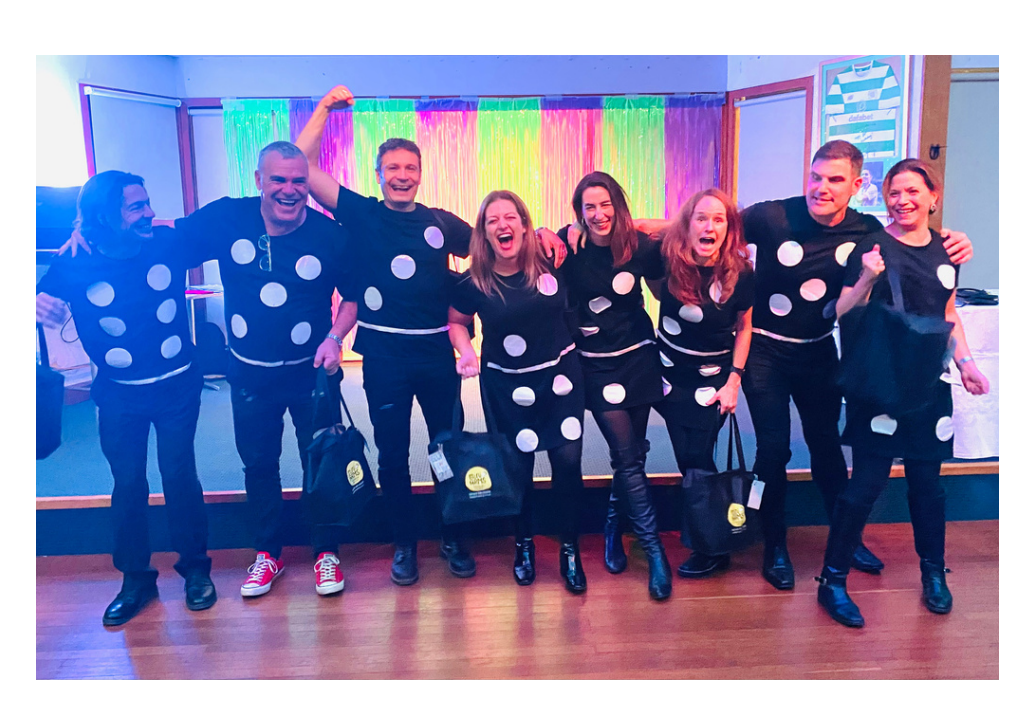
The Dazzling Dominoes 2023 FOTV Trivia Night Champions