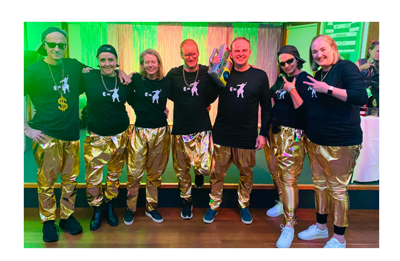
E=MC Hammer 2023 Best Named & Dressed Team