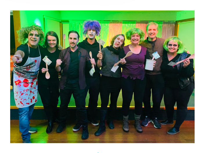
Need Brainz 2023 Wooden Spoon Recipients