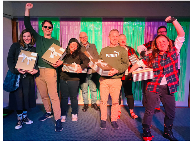
2022 FOTV Trivia Champions - The Breakfast Club

In 2022, The Breakfast Club took home the crown and every member of the eight-person team received a box of goodies. Want to know what you're playing for in 2023?! It's epic - almost $1300 in prizes for the winning team: