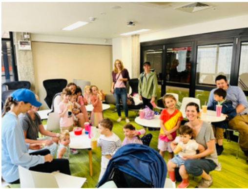
Kindy Weekly After School Hangs